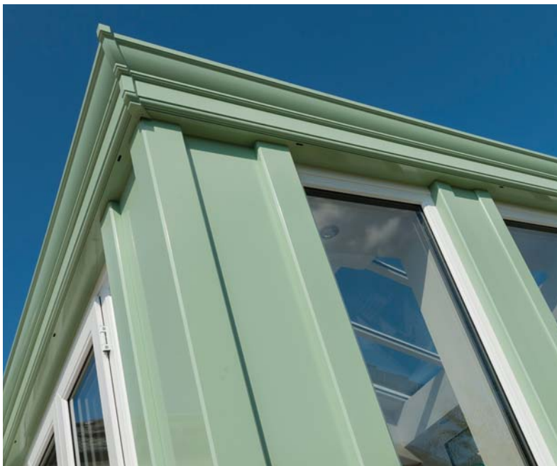
Cornice can be used with brick columns or with super insulated Loggia columns ▲

Change the visual dynamics externally too by using Cornice for a smooth finish at the wall/roof interface.