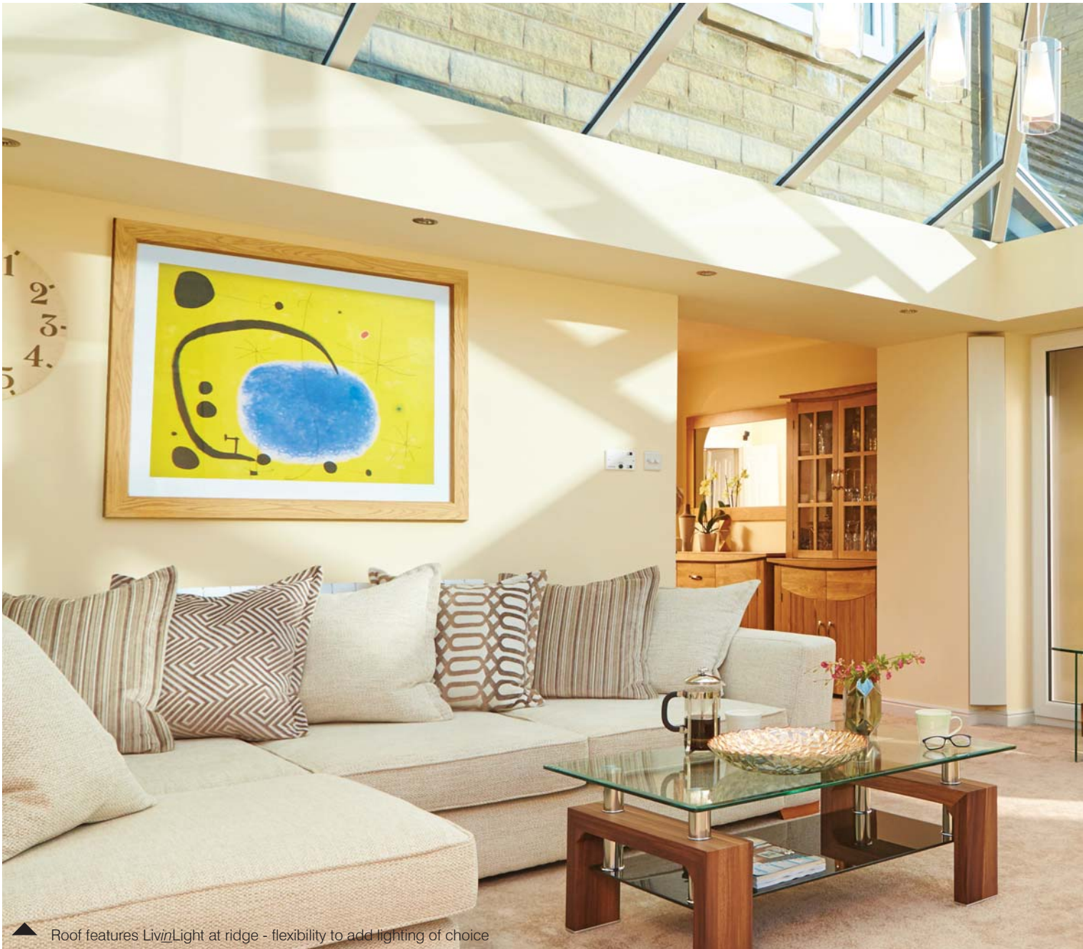
▲ Roof features LivingLight at ridge - flexibility to add lighting of choice