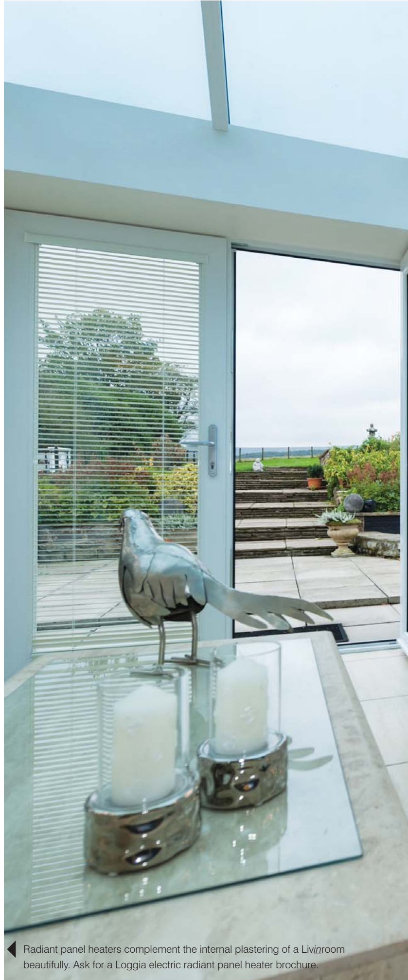
◀ Radiant panel heaters complement the internal plastering of a Livingroom beautifully. Ask for a Loggia electric radiant panel heater brochure.