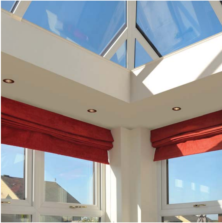
▲ Livingroom is perfect for downlighters or cable runs

Livingroom uses an Ultraframe Classic glazed roof to which is attached a steel work ladder system at eaves and glazing bar positions. This is then plasterboarded and plaster skimmed to form a perimeter ceiling.